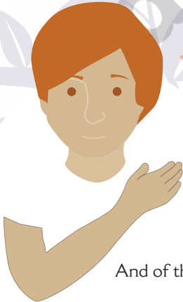
And of the