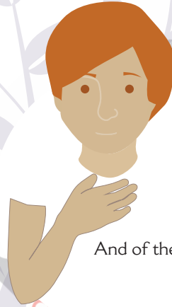
And of the Son