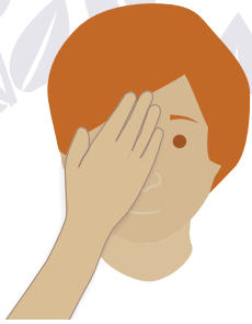
In the name of the Father